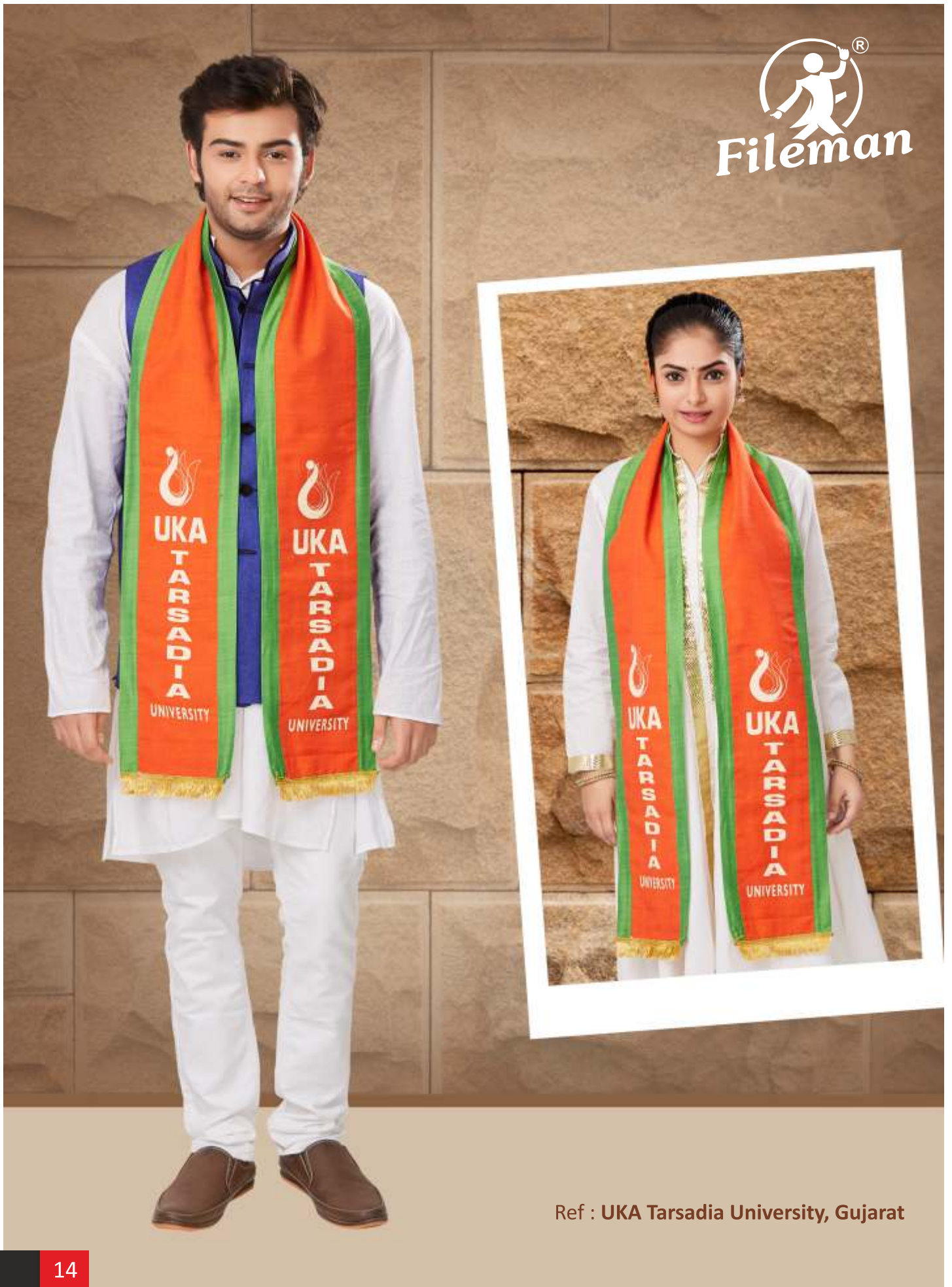
Ref : UKA Tarsadia University, Gujarat